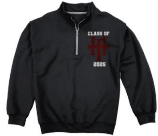
SCREEN PRINT "CLASS OF HT 2025" GRADWEAR QUARTER ZIP $50.00