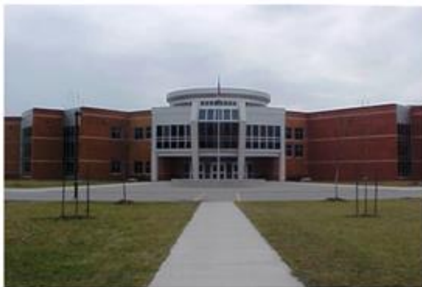
From Holy Trinity