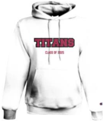
TWILL EMBROIDERED "TITANS 2025" CHAMPION HOODIE $72.00