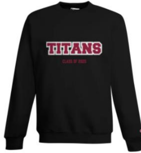
TWILL EMBROIDERED "TITANS 2025" CHAMPION CREWNECK $62.00